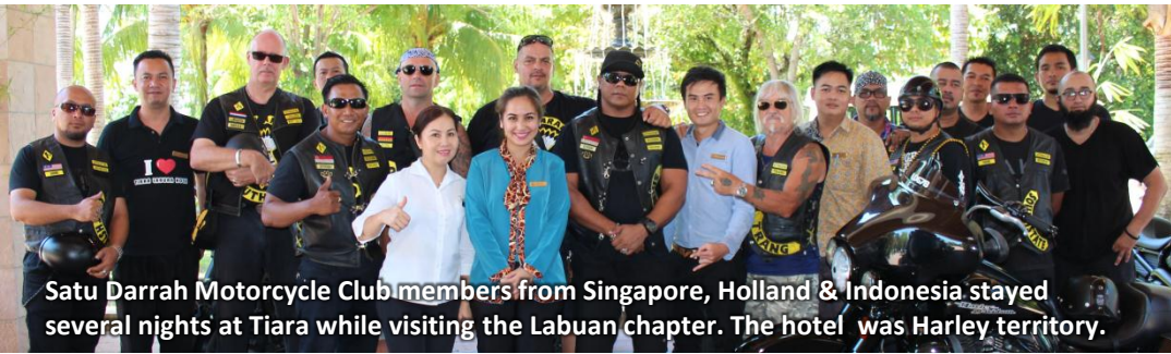
Satu Darrah Motorcycle Club members from Singapore, Holland & Indonesia stayed several nights at Tiara while visiting the Labuan chapter. The hotel was Harley territory.